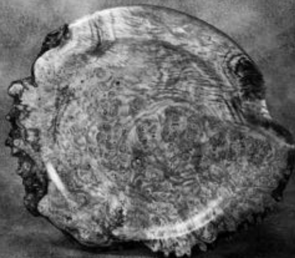
Tray - Burmese Maple

I am an amateur who enjoys working with locally sourced woods.