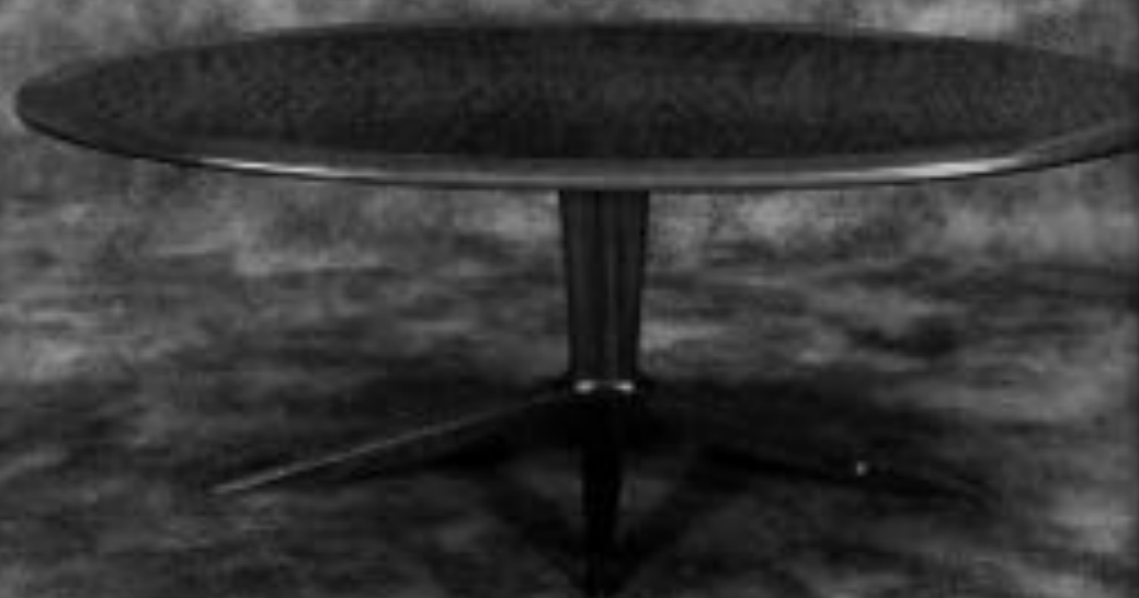
Coffee Table - Pample veneer and Hondurak Mahogany Flame wood.