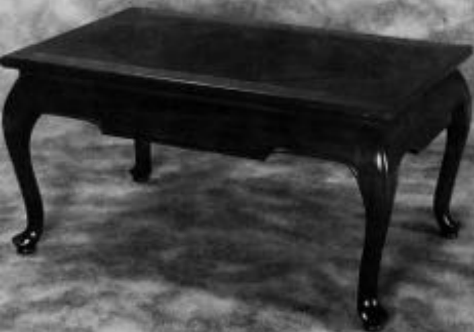
Coffee Table - Honduras Mahogany