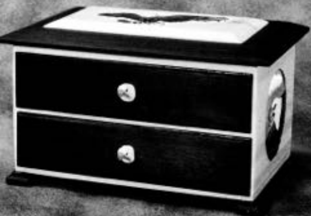
Eagle Box - Yellow Redwood, Original Walnut and Pyskin