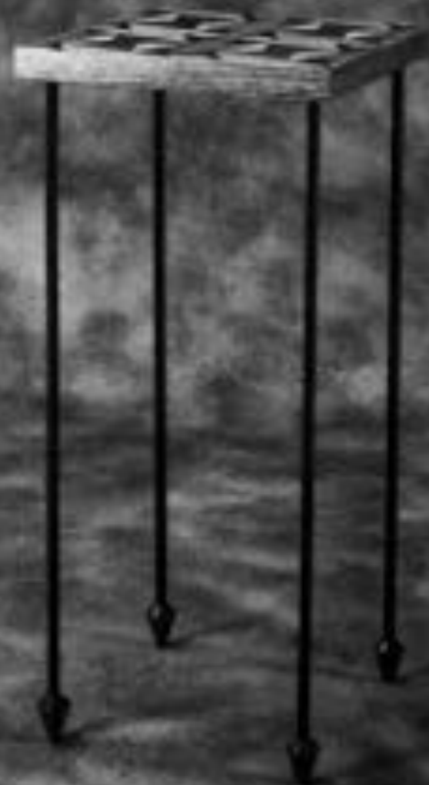
Arrow Dynamics II - Sublime, various natural veneers and steel