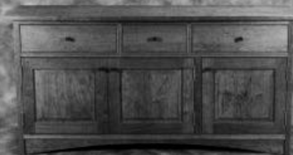
Sideboard - Cherry and American Sycamore