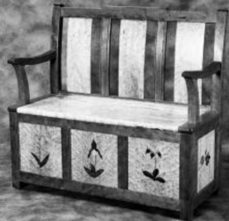
Hall Bench - Cherry and Maple

Desk - Koa, Maple and Ebony (shown on back cover)