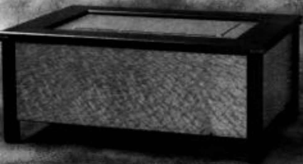
Jewellery Box - Lacewood and Walnut