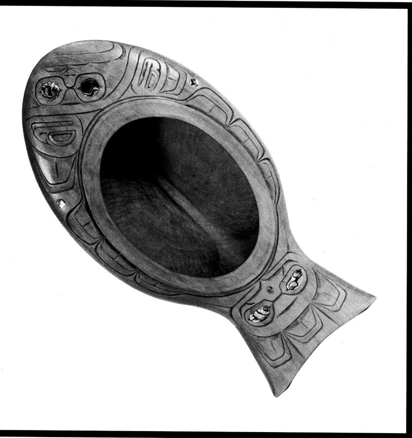
Halibut Potlatch Bowl