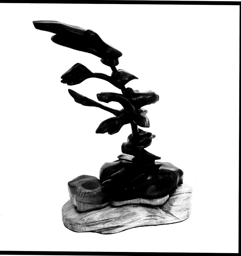
Wind-blown Pine, Georgian Bay cut, spalted maple, cherry