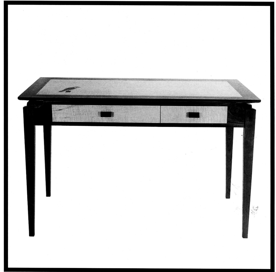
Computer Desk cherry, curly maple, assorted veneers