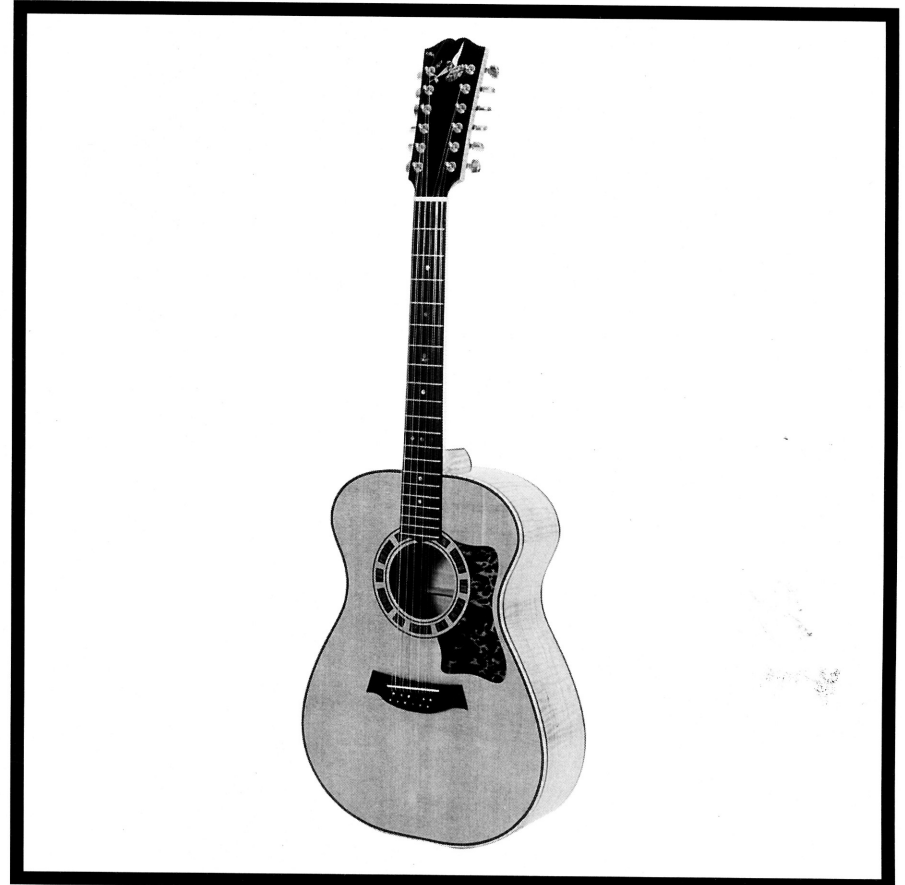
12 String Acoustic Guitar (Hummingbird)

curly maple, spruce, ebony, koa, mother of pearl, abalone, gold plated tuning machines