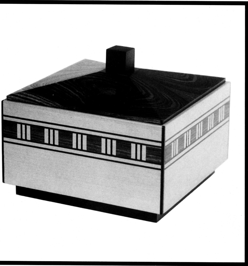
Lady's Chest -Second place lemonwood, kingwood, ebony, leather