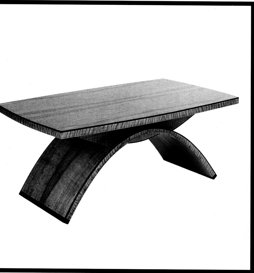
ee Table d anigre, walnut