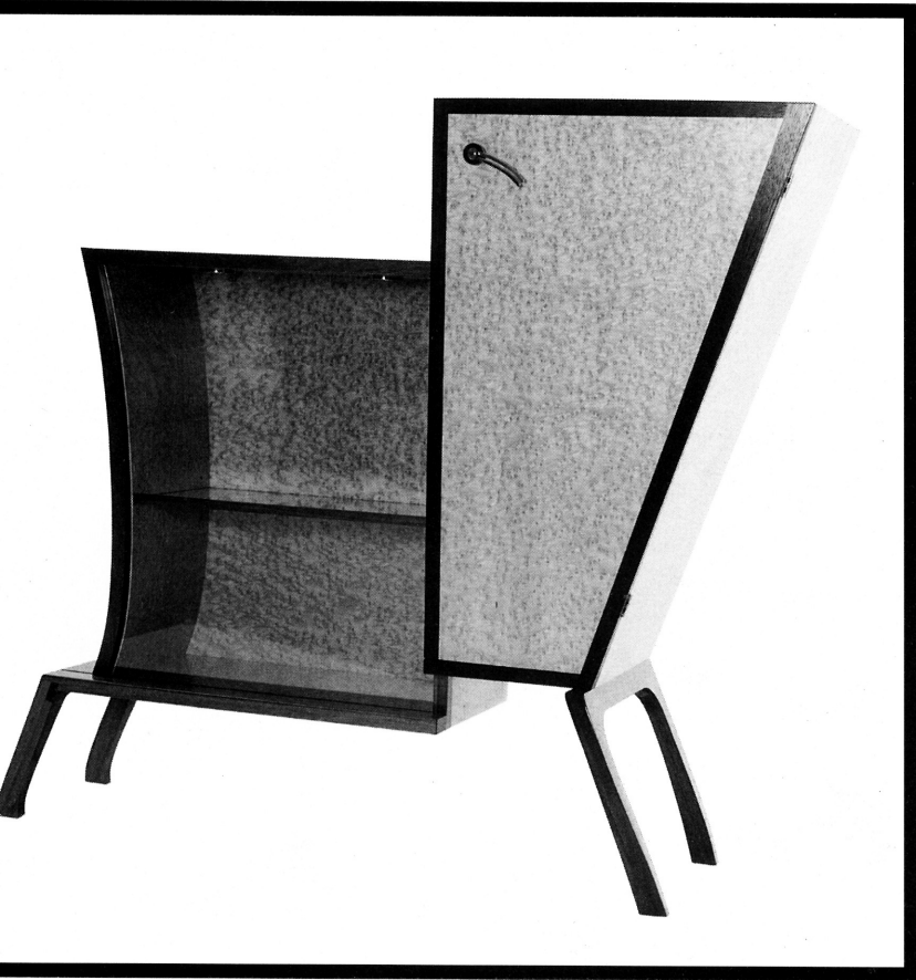
"The Love Song" cabinet eye maple, nogal, bubinga