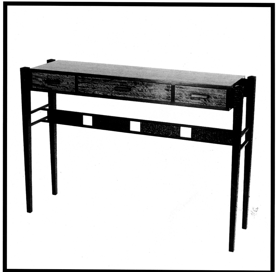
Hall Table -Best of show wenge, paldao, maple, holly