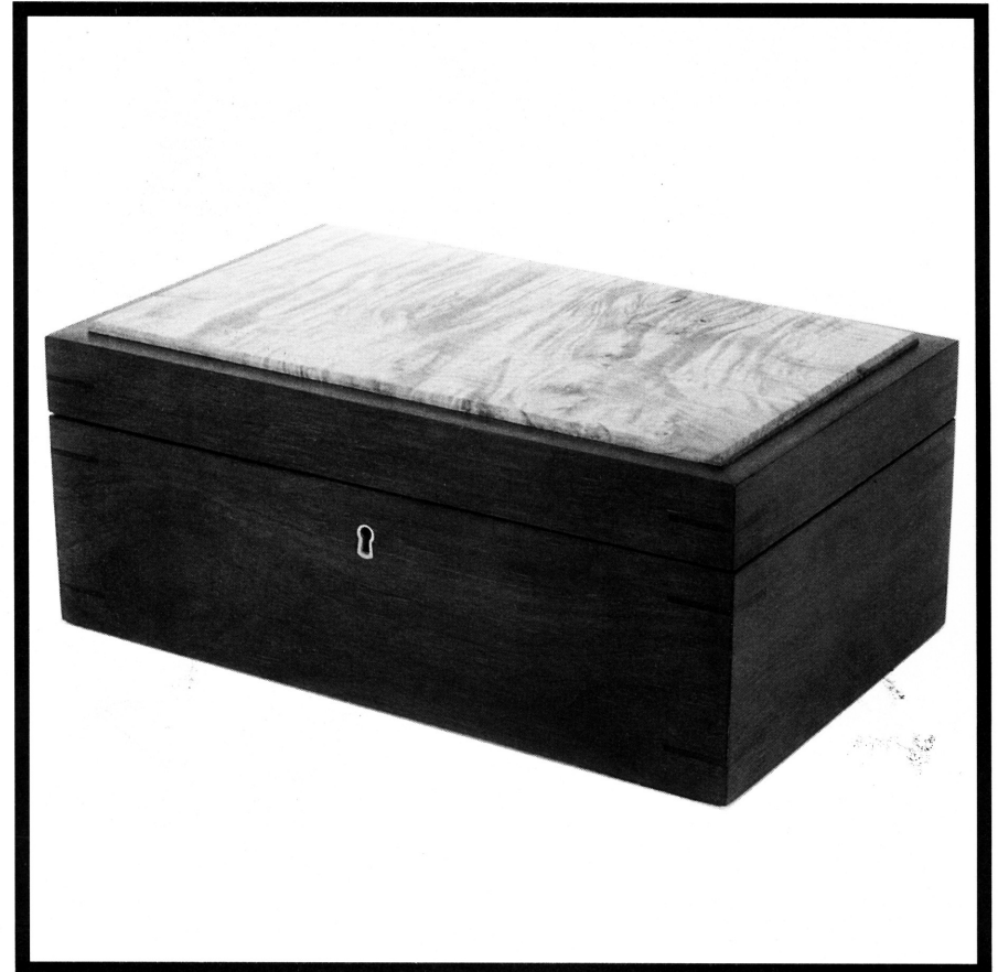
Mission Humidor -Honourable mention purpleheart, curly maple, spanish cedar