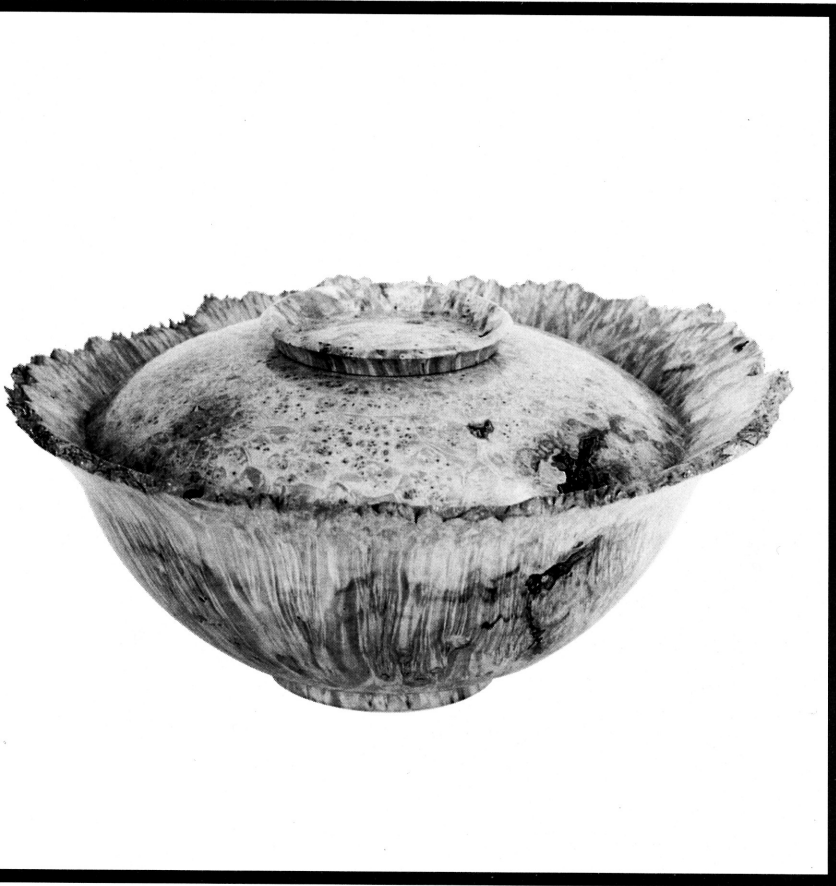
Turned Hollow Form turned box elder burl