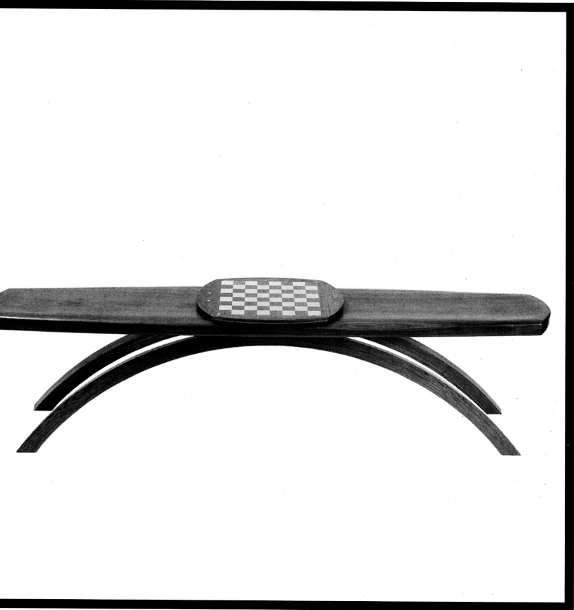
"The Balance" bench with game board -Honourable mention