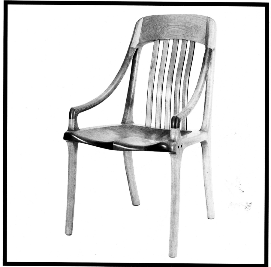
Chair -Third place