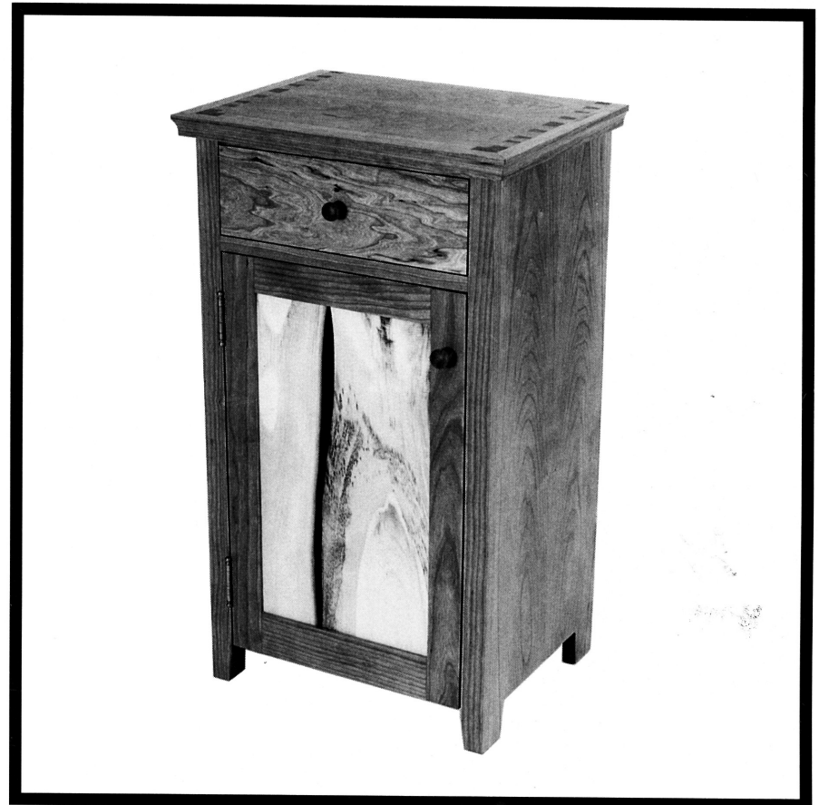
Bedside Cabinet (one of a pair)

cherry, poplar, cedar, english brown oak, buffalo bone shelf pins