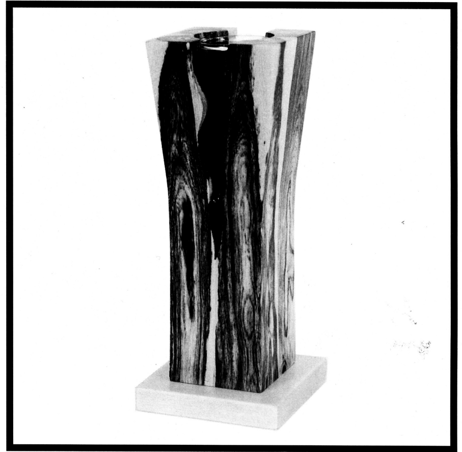
Ikebana Vase carragana, glass