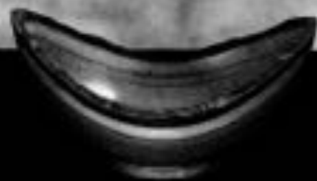
Natural Edge Bowl - Lignumum

"I am most interested in the form of a piece whether it be functional or purely decorative. Subtle changes in shape can make the difference between the mundane and a piece which stands out."