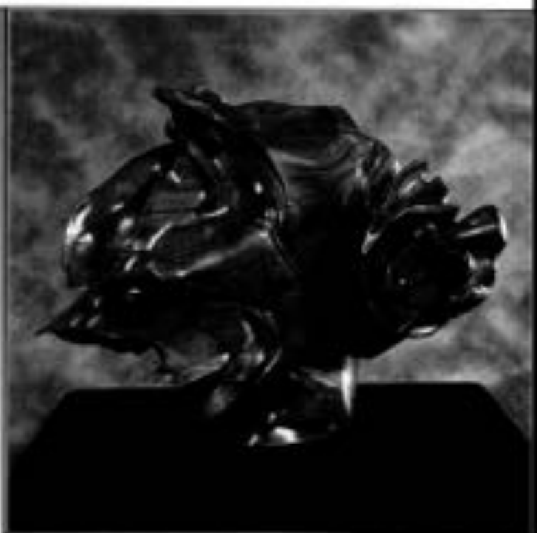
Untitled - Cherry