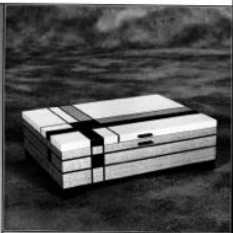
Greeting Card Box • Blue • - Pecan, Holly

"Our creation can come only from how we have been inspired by those before us, as they have been inspired by others before them. We can only hope we have chosen wisely."