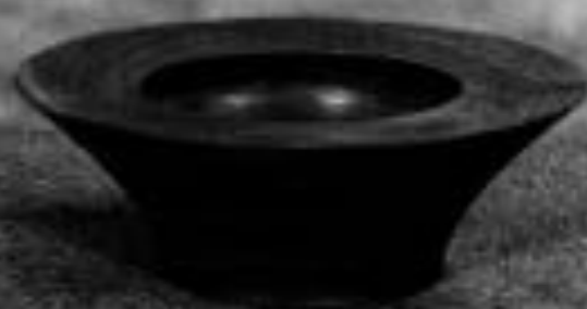
Bowl - Walnut

"Taking a rough piece of wood and releasing its inner beauty gives me a warm soulful feeling that has allowed me to create this piece. I also attribute a lot of my skill to fellow SWS members who have shared their passion for woodwork with me."