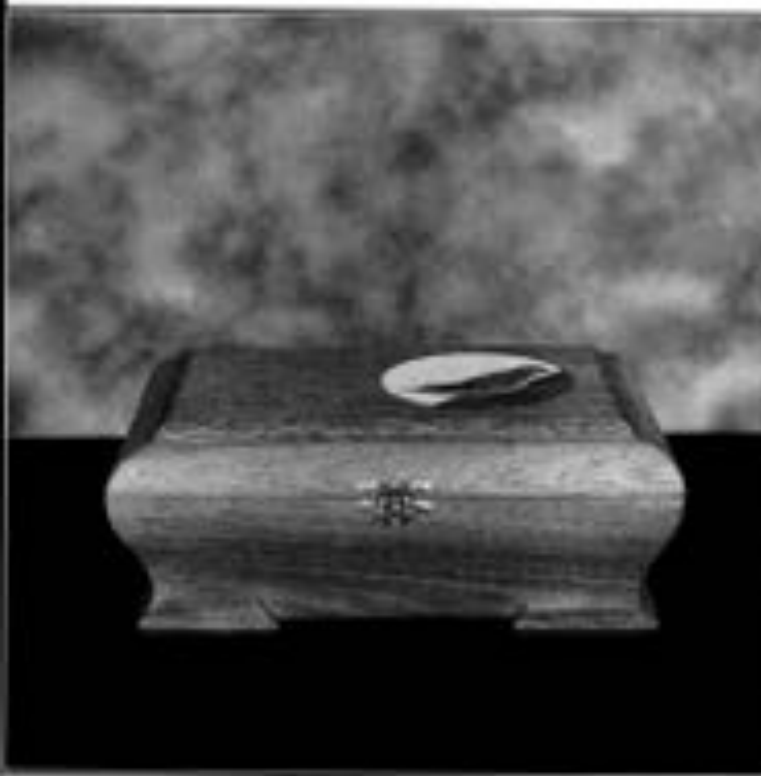
Nuthatch Jewellery Box - Honduras Mahogany

This piece combines my enjoyment of birds, an attempt at marquetry, and building a jewellery box that I hope one of my daughters will appreciate. One wonderful aspect of woodworking is the unending variety of techniques to be tried and perfected. The trying is easy, the perfecting is not!