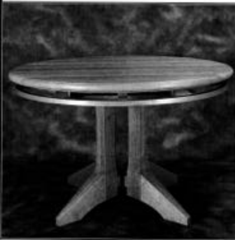
Dining Table - Cherry