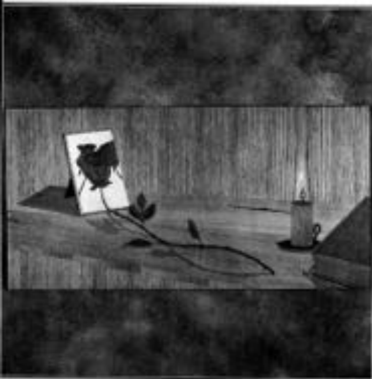
Past Paradise - various veneer species

Other Works Beech Box - Beech, Brazilian Rosewood