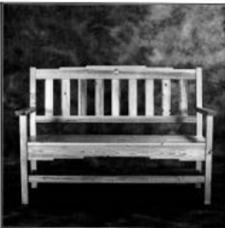
Pine Bench - Pine, Silver

This bench was inspired by the 400 year old Hispanic design traditions of New Mexico. It was built with pine sawn in a small mill west of Calgary.